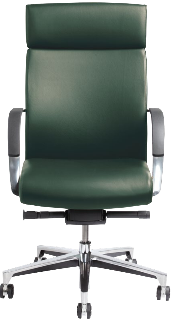
235D PRINCESS LEATHER Pesto